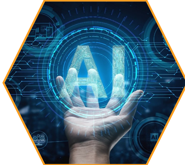
AI Pricing Tools